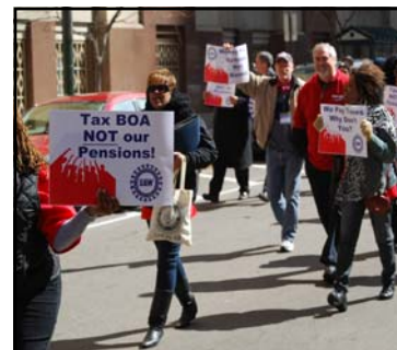
Delegates of UAW Local 31 was among many who rallied for equal representation in the work place