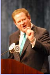
Msnbc commentator Ed Schultz was a guest speaker at the Collective Bargaining Convention in Detroit, MI.